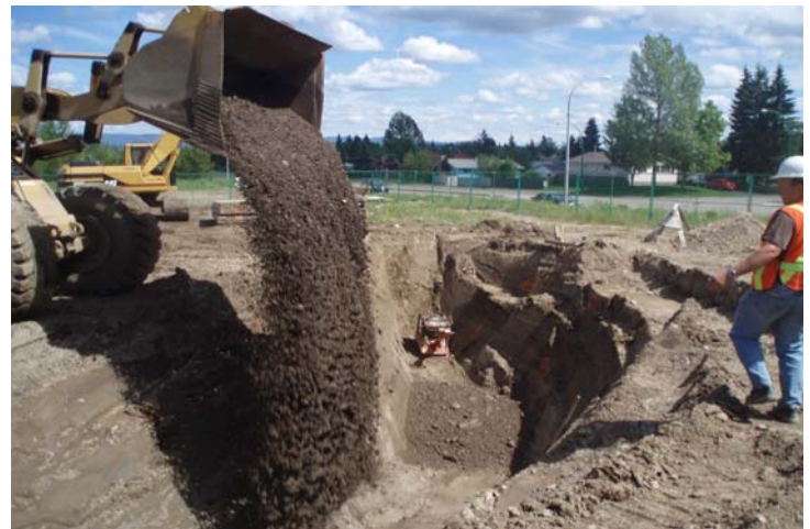
The construction of the foundation started - June 8, 2009.

The first phase of the project establishes the minimum spaces required for community activities for the Muslim population of Prince George. The principal space is the multi-purpose hall for social and recreational activities. A small prayer-hall with a mezzanine provides space for congregational prayer. Two classrooms provide space for weekend religious and language education and could be used as a daycare.