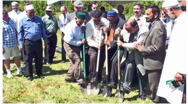
Ground breaking - Jumada Al-Akhira 14, 1430 - June 7, 2009.

The intent in this project is to incorporate as many environmentally sustainable strategies as possible. In addition to natural ventilation and material selection noted above, daylight harvesting, on site storm water management and efficient fixtures and equipment will be investigated.